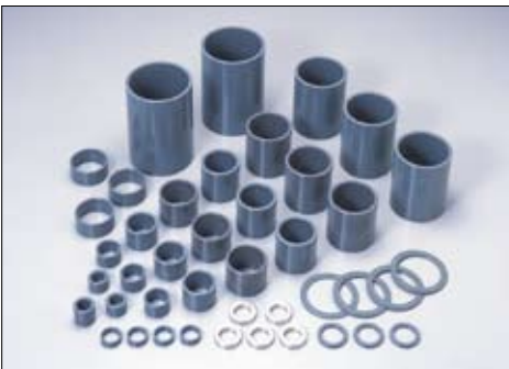
Anisotropic ring magnets

Due to their ring shape, these NMX Series Nd-Fe-B Sintered Magnets with radial anisotropic ring magnetic field orientation can be easily assembled into rotors. In addition, the ring magnets allow skew magnetization, reducing cogging torque.